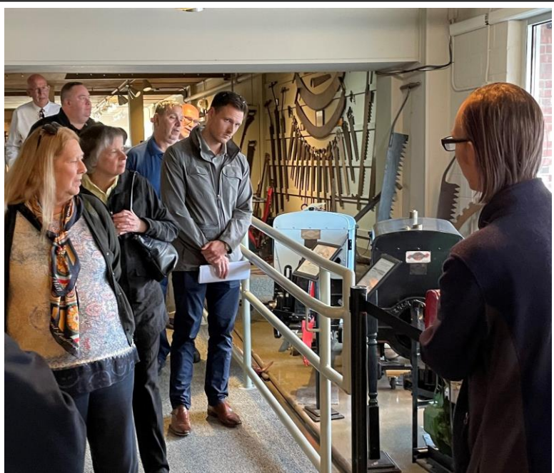
Chapter members, family, and guests learn about tools used in the ice trade from the Knowlton Museum tour guide.

During his career he developed a passion for the unique history of the ice industry and became an avid collector of artifacts and memorabilia. That collection is now housed at the Knowlton Ice Museum of North