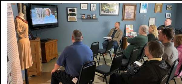
Above: Members watch an interesting video with historical footage of ice harvesting and processing operations.

America in downtown Port Huron. It contains over 3,000 items used in the cutting, harvesting, storing, selling and use of natural ice from one of the largest industries in the United States around 1900.