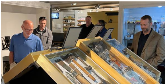
Below: The museum contains over 3,000 items used in the cutting, harvesting, and processing of ice.