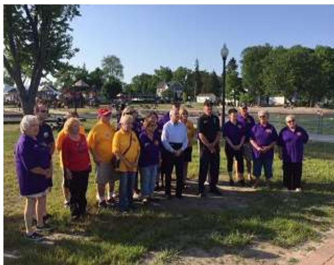
$103,000 Raised: The local Lions Club donated $10,000 and were instrumental in raising the rest of the project funds with help from local businesses and private donors.