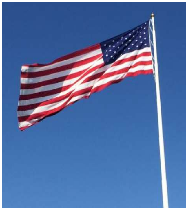
Old Glory: Atop the flagpole waves a 30-by-60 foot flag.