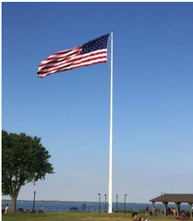
Tallest Flag Pole in Michigan: The 160-foot flagpole stands near the water's edge in New Baltimore.