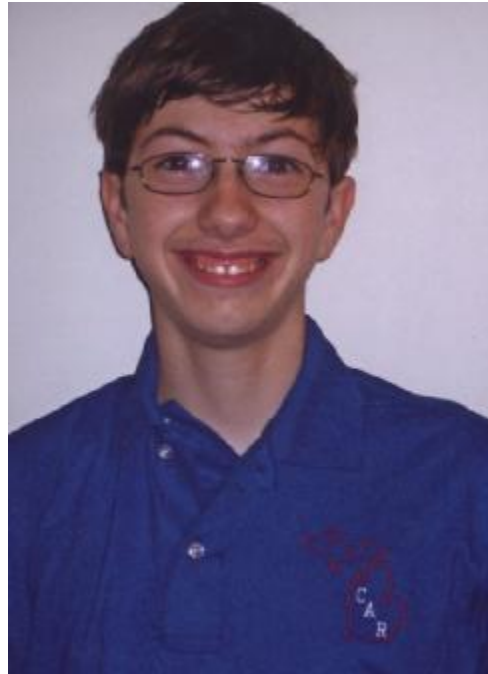
Blue Embroidered Polo Shirt with the State of Michigan and C.A.R. inside Sizes available are Youth 4/5 to Adult 6x for $15 a piece