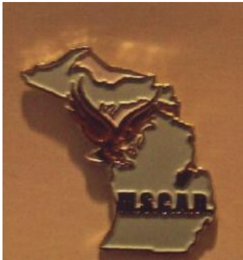
State of Michigan Pin with and Eagle and M.S.C.A.R. Yours for $5.00